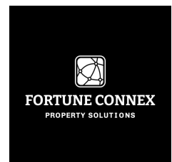
Rental Fortune Connex 0480100267