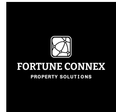
Rental Fortune Connex 0480100267