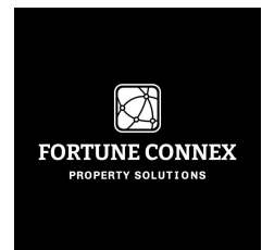
Rental Fortune Connex 0480100267