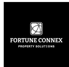
Rental Fortune Connex 0480100267