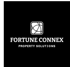
Rental Fortune Connex 0480100267