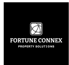
Rental Fortune Connex 0480100267