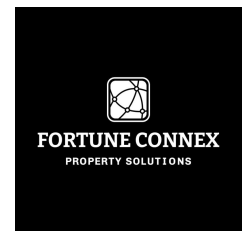
Rental Fortune Connex 0480100267