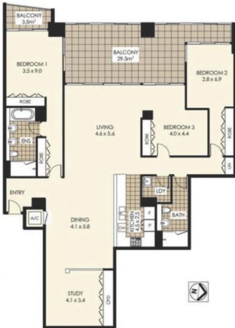
APARTMENT FLOOR PLAN