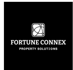
Rental Fortune Connex 0480100267