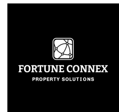
Rental Fortune Connex 0480100267