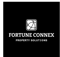
Rental Fortune Connex 0480100267