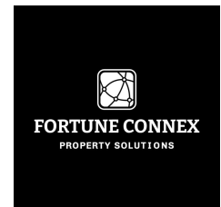
Rental Fortune Connex 0480100267