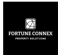
Rental Fortune Connex 0480100267