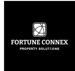
Rental Fortune Connex 0480100267