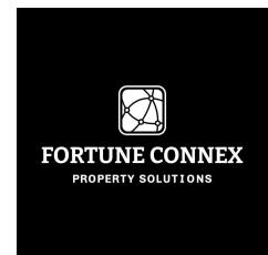
Rental Fortune Connex 0480100267